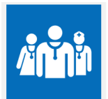
People Doctors, medical groups, and other professionals by specialty

You can also do a search by category to find a doctor.